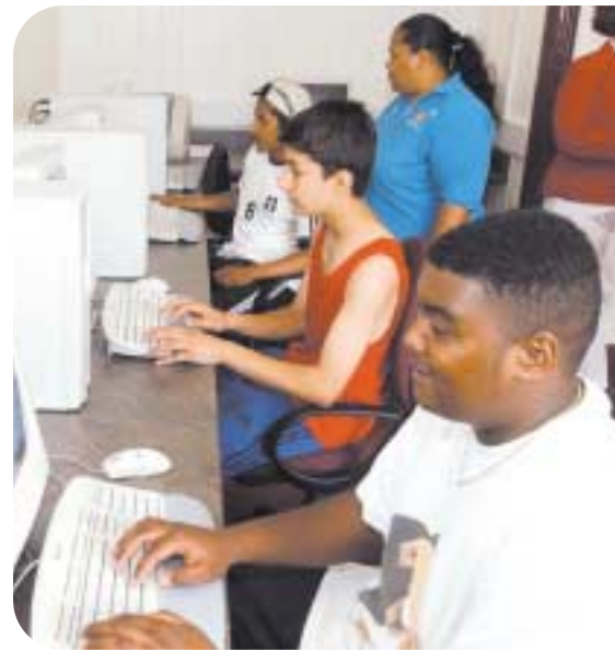
▶ Young people benefitting from computer based learning.

LSC Staffordshire's review is getting right down to the grassroots. It's examining education and training for 14-19 year olds, adult skills and community learning, plus an agricultural college, special schools and learnirect computer-based learning. It will also look at work experience for 14-16 year olds and training for the new vocational qualifications.