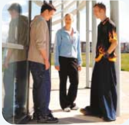
► Young people's views need to be heard.