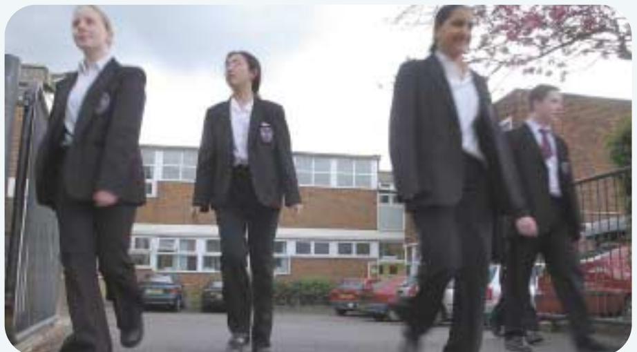
▶ Future sixth form students need the correct provision in their area.

LSC Gloucestershire and the local education authority have conducted a major review of school sixth forms to identify their strengths and weaknesses, prompting a welcome public debate. They have also drawn up an entitlement statement, outlining what learners, businesses and the local community should expect from education and training in the area. Options range from basic skills and vocational programmes to higher education.