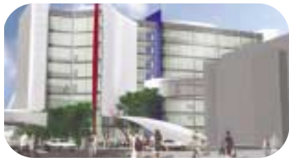
▶ The new campus for South East Essex College in Southend – one of the many capital projects supported by the LSC.