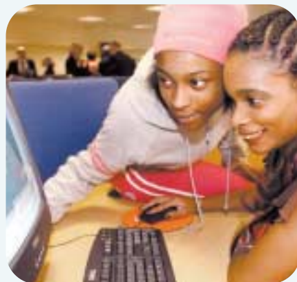
▶ Heads together for improved learning.

StARs are just the beginning of long-term reform of learning and skills. There is still a lot of work to be done. Progress is being made towards a coherent system of learning for 14-19 year olds and we are starting to identify ways in which education and training can promote sustainable employment.